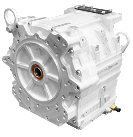
Made with BorgWarner HVH250-115 Motor Core

The SS-250-115 is a powerful, durable and rugged electric motor / generator with integral sump, mechanical oil pump and heat exchanger for use in on- and off-road highway vehicles, power generation and other special high power applications.